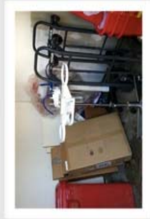
Biohazard room in BH location.